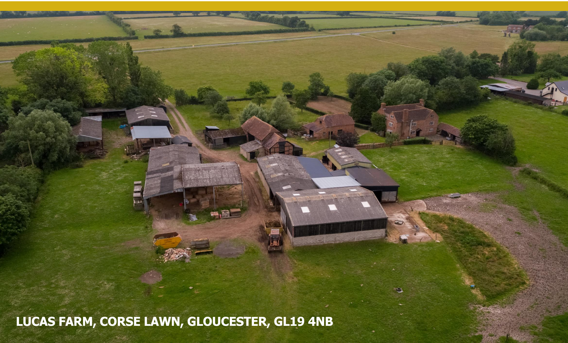
LUCAS FARM, CORSE LAWN, GLOUCESTER, GL19 4NB